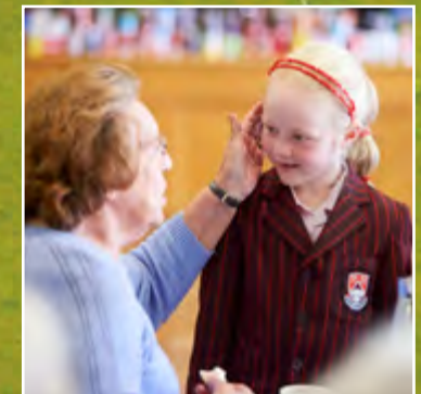
We sing songs, tell poems and share stories that can only be told face to face!