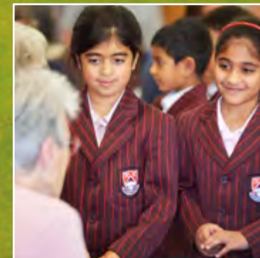
Every year our pupils host tea for members of local churches at our Harvest Festival.