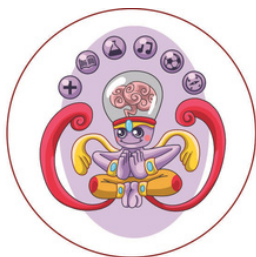
Flexibility of Mind