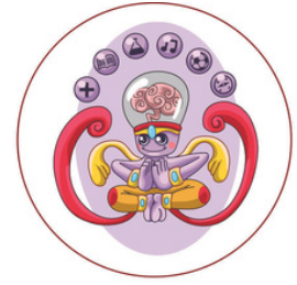
Flexibility of Mind