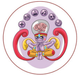
Flexibility of Mind